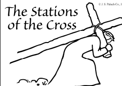
The Stations of the Cross